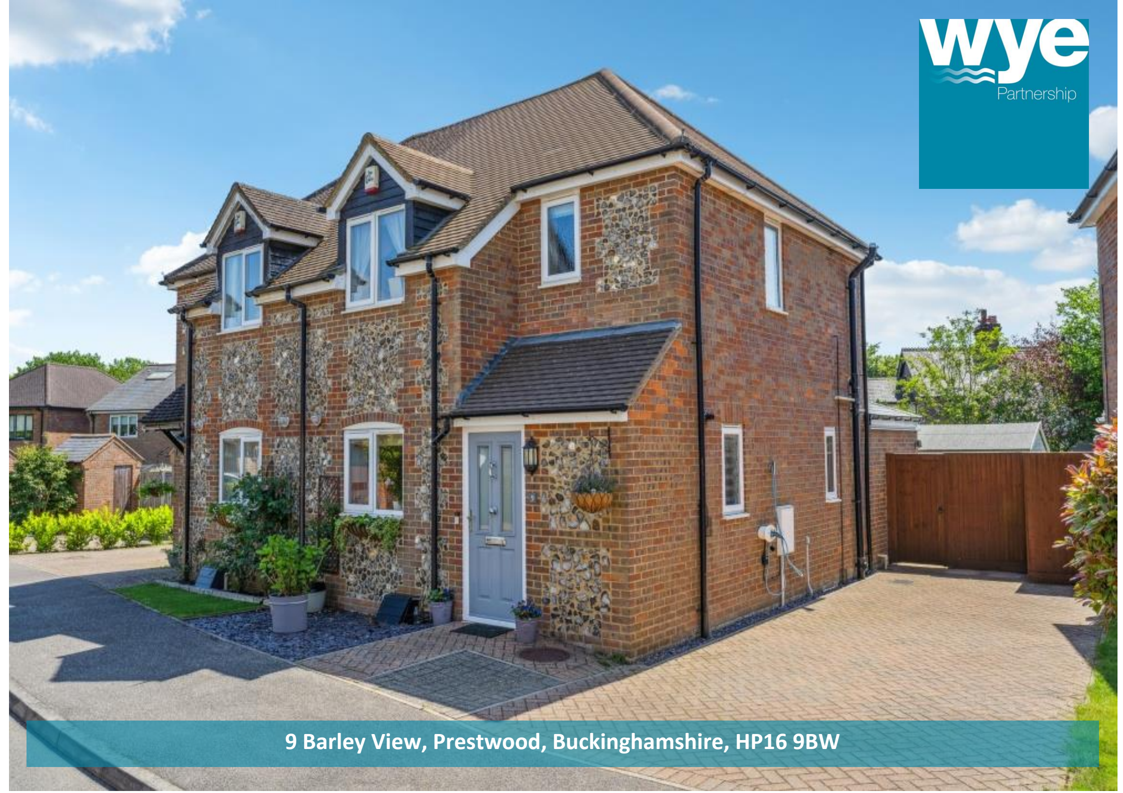
9 Barley View, Prestwood, Buckinghamshire, HP16 9BW